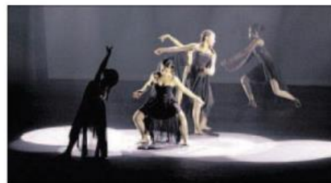
Contemporary dancers perform to raise food for the hungry in Artists for a Cause annual series Dance for Food.

ment (Nov. 8); Dance Academy of Stuart, Stuart (Nov. 22); and Mo's Dance Works, Stuart (Nov. 22).